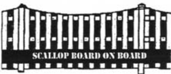
SCALLOP BOARD ON BOARD