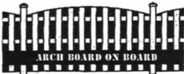
ARCH BOARD ON BOARD