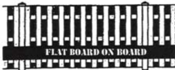
FLAT BOARD ON BOARD